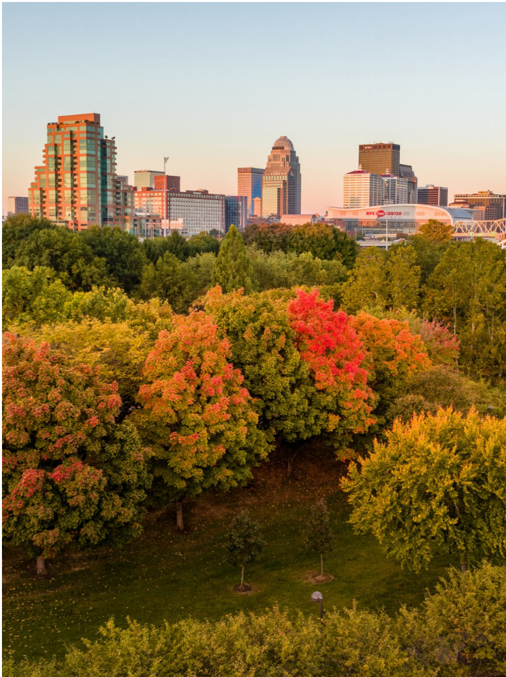
Downtown Louisville in Autumn